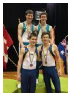
Mens team event winning gold!