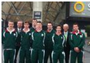
MAG Team Including Coaches and Officials