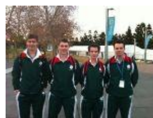
MAG Team arrive at Nationals