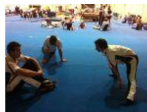
Warming up at Nationals

This year the catering was arranged by the championship organisers. The boys had lunch and teas either delivered to our accommodation