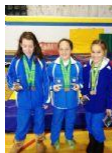
Launceston PCYC Girls Medalists