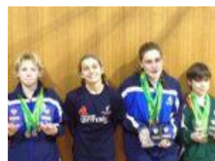
Happy Kingborough Trampolinists