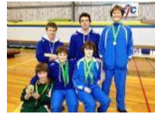
Launceston PCYC Boys Medalists