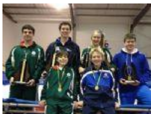
Overall State Trampoline Champions