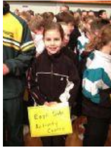
Eastside Activity Centre Lined up