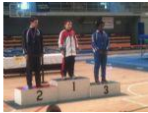
Makka 3rd in Level 6 Tumbling