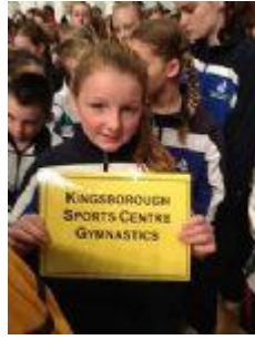
Kingborough Lined up