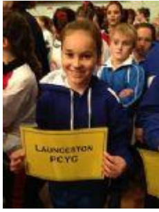
Launceston PCYC Lined up