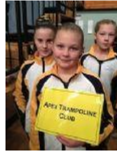
Apex Lined up